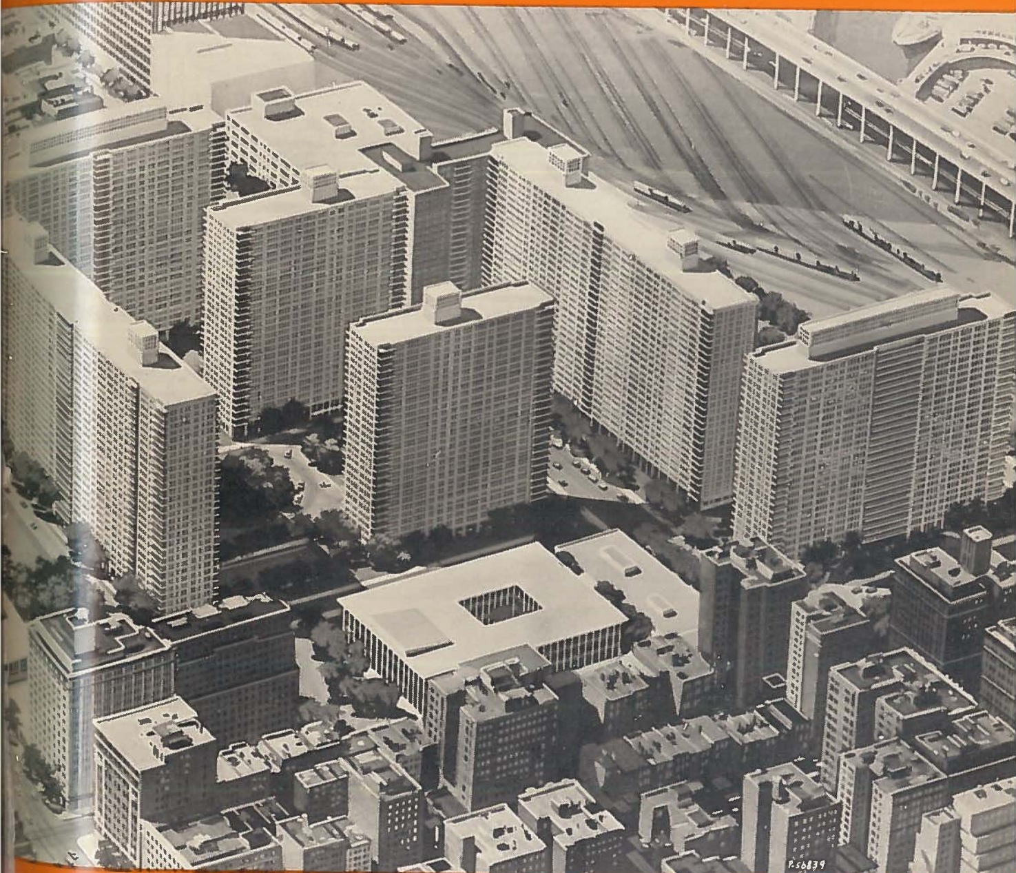
LINCOLN TOWERS, NEW YORK CITY

AN OFFICIAL PUBLICATION OF THE NATIONAL DISTRICT HEATING ASSOCIATION