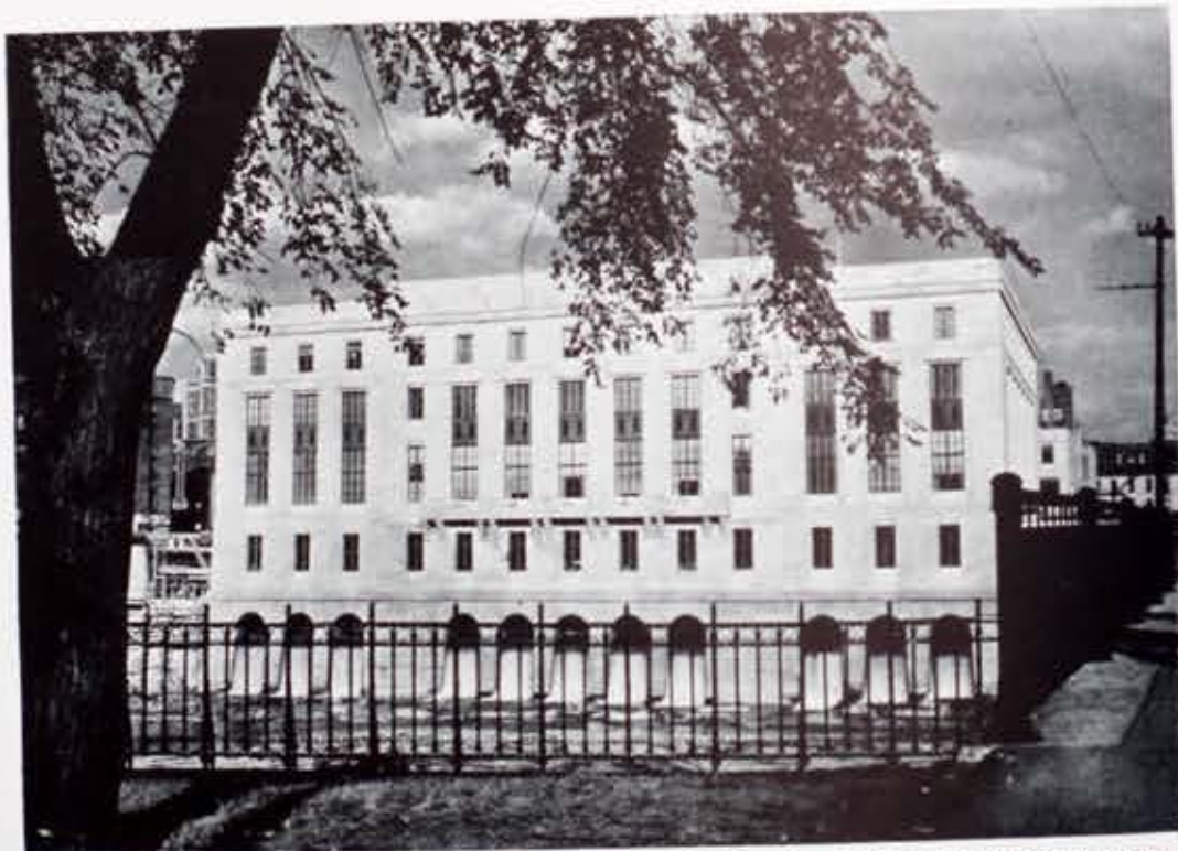
Rundel Memorial Library "snapped" from the west end of the Court Street bridge. Such a beautiful edifice, housing as it does thousands of beautiful books and works of art, MUST be kept scrupulously clean. Steam heating makes this job easy as it eliminates boiler, stack, coal and ashes and brings heat to the building—tailor made and "Ready to Use."